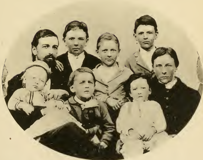
W. B. MAXWELL